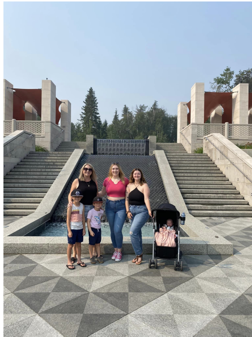
Dates with DG: U of A Botanical Gardens