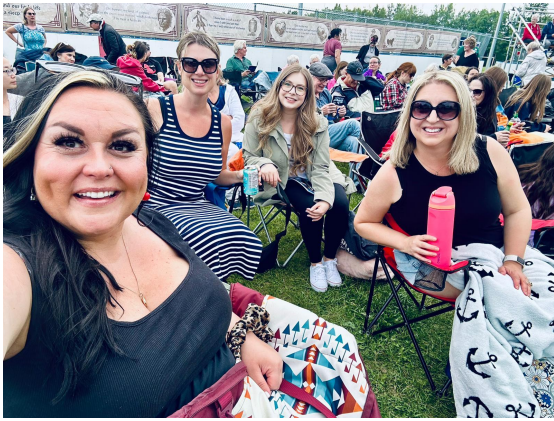
Dates with DG: Freewill Shakespeare Festival

Thank you to everyone who planned and attended our recent events! Here are a few things we've been up to, looking forward to seeing you at an event soon.